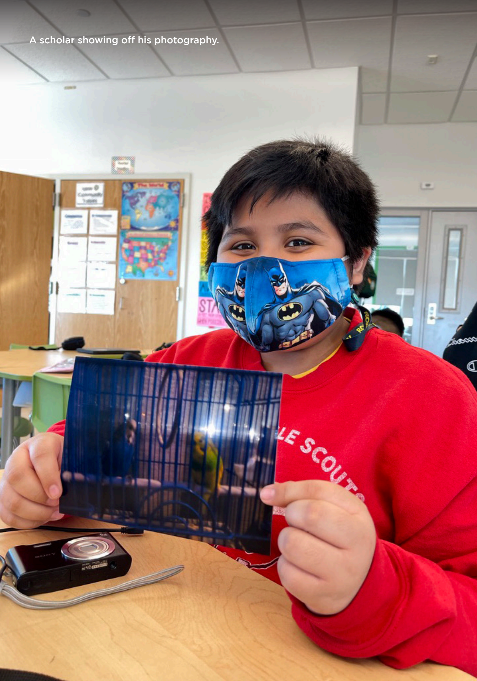
A scholar showing off his photography.