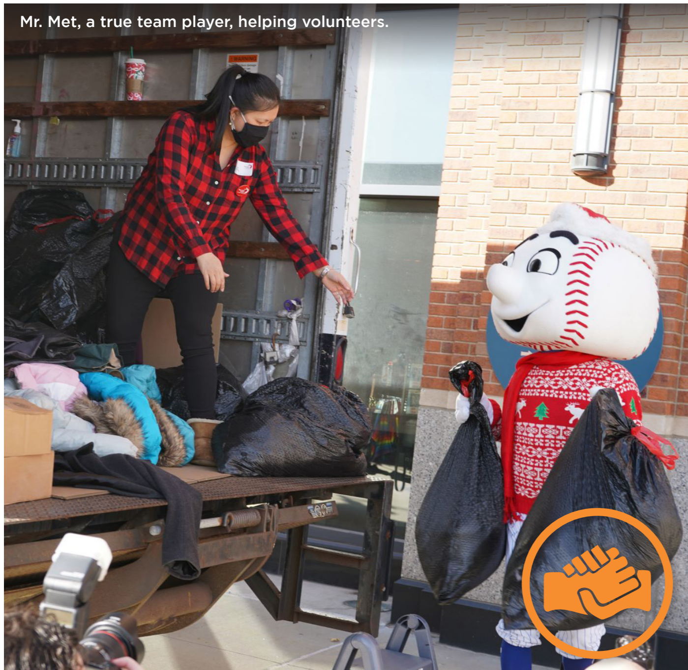
Mr. Met, a true team player, helping volunteers.

Our work would not be possible without the steadfast commitment of our partners and the vibrant communities behind them. More than ever, New York Cares is proving itself as a philanthropic partner, increasing corporate impact on local issues, and increasing the morale and satisfaction of all who participate.