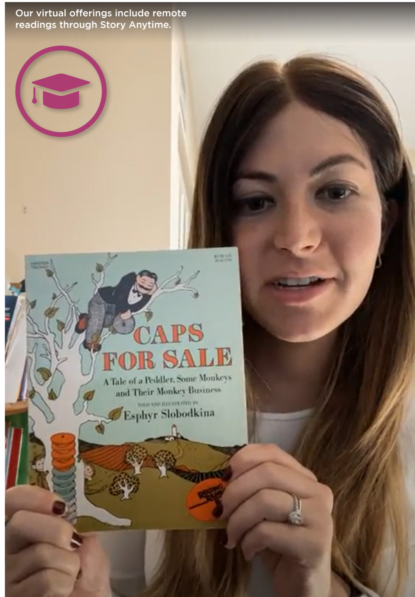
Our virtual offerings include remote readings through Story Anytime.

Longtime corporate partner Morgan Stanley generously invested time, resources and expertise into our programming—contributing more than 300 volunteers on 214 projects for a total of 266 hours. Project highlights included reading to children, career readiness for teens, English conversations for new language learners, and phone calls to seniors.